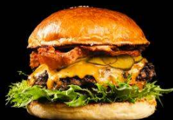
Hilton's Signature Classic Cheeseburger

100% Aussie Beef Patty, California Smoked Cheddar, Bacon, Pickles, Caramelized Onions, Tomato, Lettuce