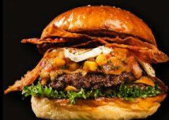
Spicy Island Smashed Burger

Smashed 100% Aussie Beef Patties, Homemade Mango Jalapeño Salsa, California Habanero Jack, Bacon, Tomato, Lettuce