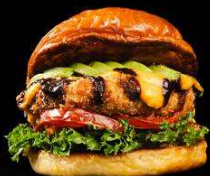
Vegetarian Plant Power Burger

Ravenswood Country Series Lodi Zinfandel / ¥ 1,800